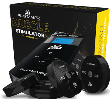
Model # PRO-1000

Completely wireless, the PlayMakar PRO is the ultimate take with you anywhere electrical muscle stimulator system. Comes with 14 programs to build strength, maximize endurance, recover faster, warm-up, manage pain, and massage away tension in just one device.